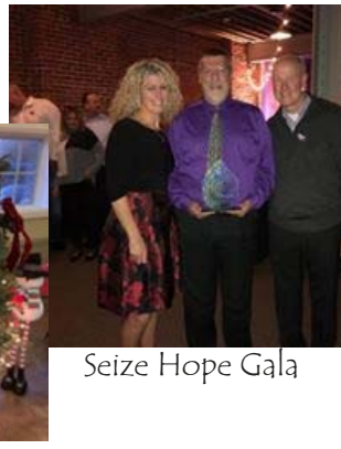
Seize Hope Gala